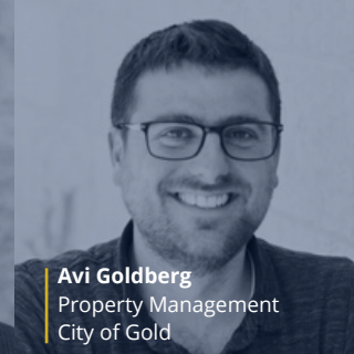
Avi Goldberg Property Management City of Gold